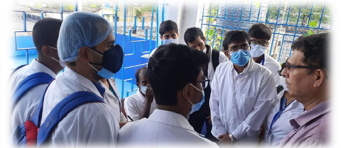
Observation of Jan Andolan Activity as a routine ACSM activity at Murarai-I TU on September 2021