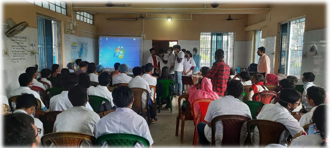
Observation of Jan Andolan Activity as a routine ACSM activity at Rampurhat-I TU on August 2021